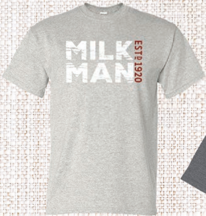
2015 Milkman Tee

In 2015, we designed a t-shirt to celebrate National Milkman Day on June 26th. It's now become a tradition to release a limited-edition shirt each year to commemorate the occasion. Since it's our 100th anniversary, it only seemed fitting that we feature our original dairy on this year's t-shirt. Show your Smith Brothers Farms pride and get a 2020 limited edition National Milkman Day t-shirt with your next order!