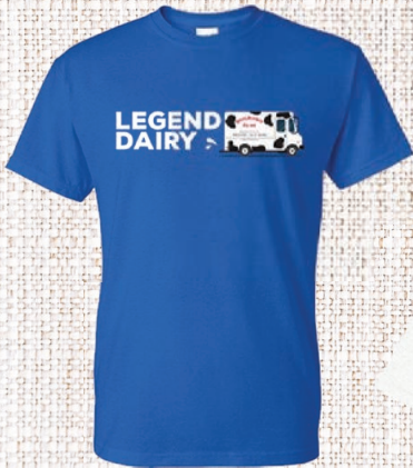
2018 Legend Dairy Tee