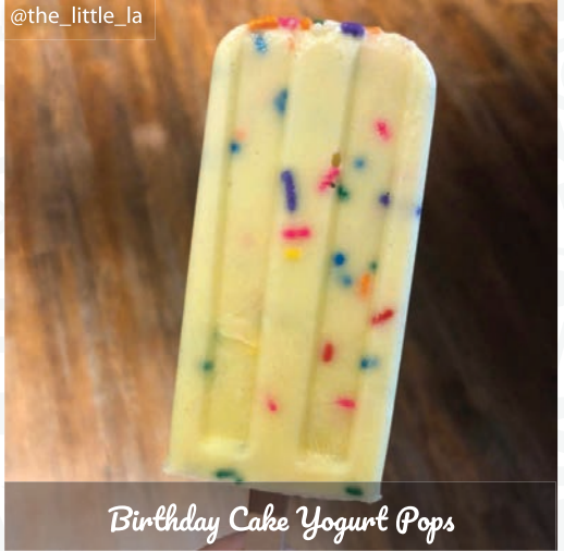
Birthday Cake Yogurt Pops