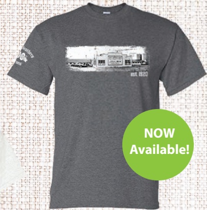
2020 100th Anniversary Tee