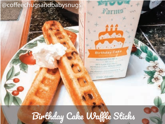
Birthday Cake Waffle Sticks