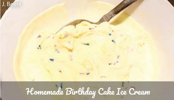
Homemade Birthday Cake Ice Cream