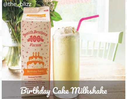
Birthday Cake Milkshake