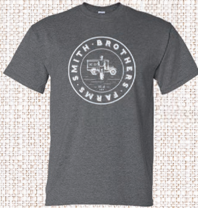
2016 Logo Tee