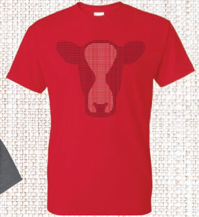
2017 Cow Tee