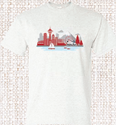
2019 Puget Sound Tee