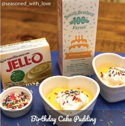
Birthday Cake Pudding